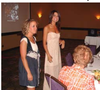
Models showing Indian dresses