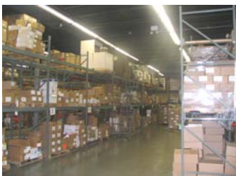
This is just a small part of the Distribution Center

Located in Lincolnwood at 7100 N. Lawndale Avenue is RI's new facility for their Distribution Center, where all the booklets and brochures come from, Rotary archives are stored, and the home of the new Toll-Free RI Contact Center.