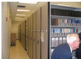
This is the archives room with new motorized sliding modules